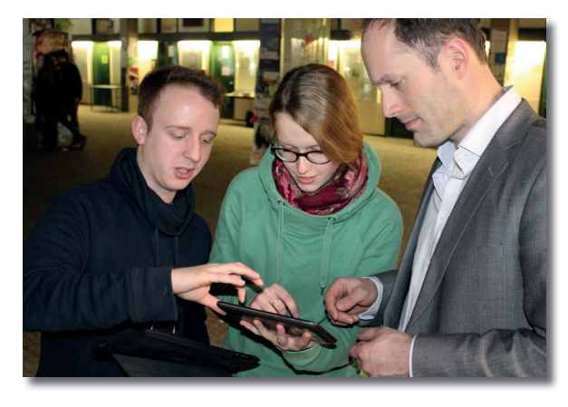
The development of UR-Walking is an example of up-to-date university course work at the Chair of Information Science. Lecturers and students try to solve real-world problems together. It is as challenging as it is instructive for both, learners and educators.

We have started to setup a portal for UR-Walking on the Web. Visit us on http://www.ur.de/urwalking for an update on our activites. We would appreciate it, if you would participate in our experiments. Of course your data will be used only for scientific purposes and data analysis is done anonymous. Currently, we are working on trials regarding the user's sense of direction and visio-spatial abilities. Furthermore, we are keen to get to know user preferences. Therefore, we will add more tests and provide an English language version soon.