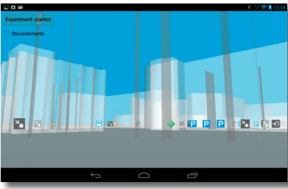
UR-Walking shows indoor (above) and outdoor surroundings schematically. Any landmarks known to system are displayed as well.

indoor as well as outdoor in order to prevent users from feeling lost. The surroundings of a person's position are displayed schematically as well as landmarks being shown. This mode of presentation facilitates the rating of both, existing and adding new landmarks.